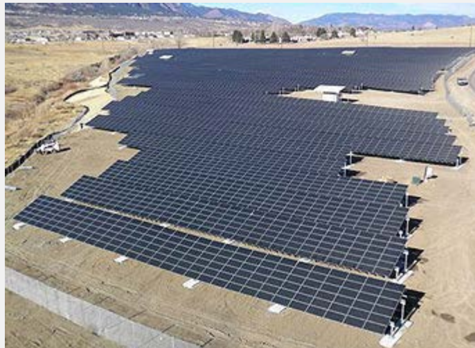
Ft. Carson, CO solar array