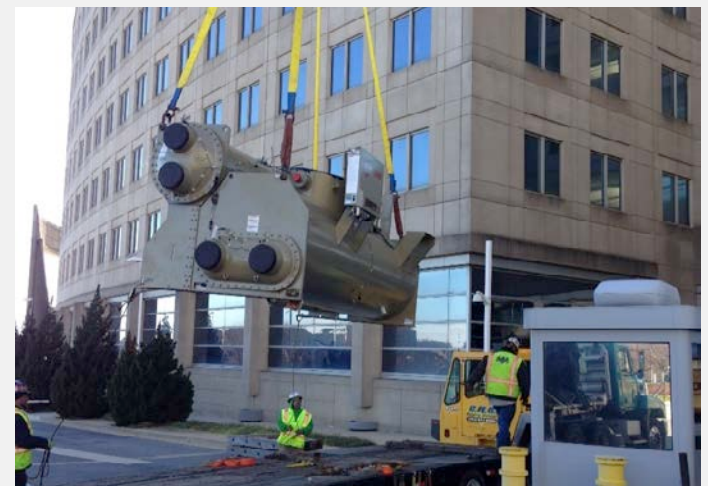
New Carrollton, MD Federal Building ESPC project : solar carport, geothermal, fields, chiller plant upgrade