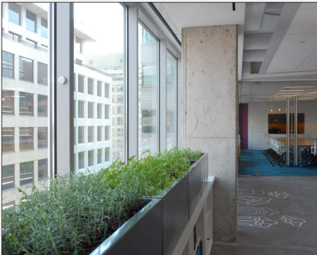
Herb Garden: ASID HQ, Washington, DC (WELL certified)